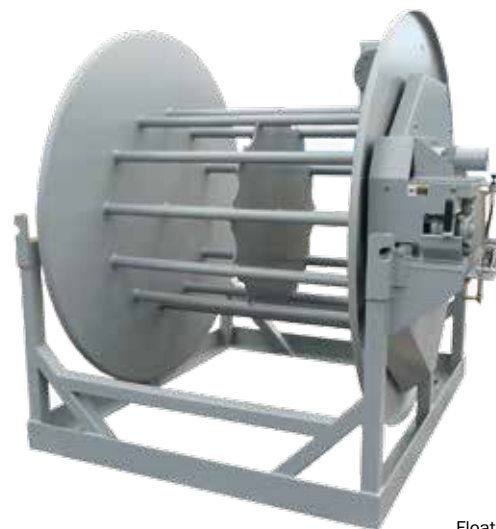
Floater reel shown with hydraulic rewind