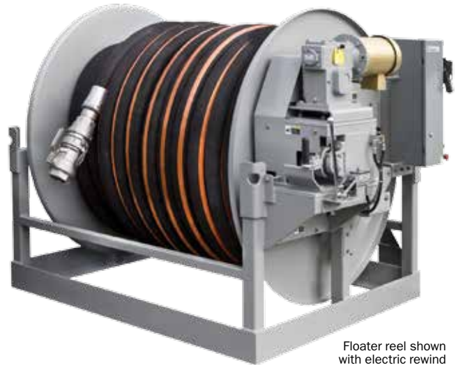
Floater reel shown with electric rewind (hose not included)